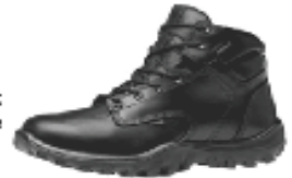
Jamestown 6" Soft Toe Boot $99.86 Full Allowance Price