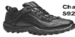
Charleston Low Soft Toe Shoe $82.66 Full Allowance Price

New Timberland Pro Series Comfort, Durability and Performance