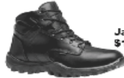
Jamestown 6" GTX Waterproof $117.86 Full Allowance Price

For all your Postal Uniform needs we've got you covered with great Union Made in the USA products.